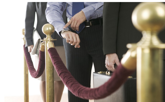
Waiting: it’s not easy for most of us.

It impresses me, therefore, that all the figures who appear in the first pages of Luke’s Gospel are waiting. Zechariah and Elizabeth are waiting. Mary is waiting. Simeon and Anna are waiting. The whole opening scene of the good news is filled with waiting people. And right at the beginning all those people in some way or